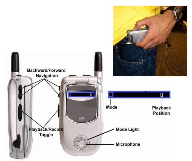
Figure 1 The Personal Audio Loop. Main picture: the device and its interface. Three buttons control record/playback mode and allow to browse the recording. A timeline and a mode light indicate the current operating state. Upper-Right picture: the device can be attached to a belt clip.

After one short deployment of PAL, some participants reported on the reactions of secondary stakeholders to their using the application, noting that in many cases conversation partners would not object to the use of PAL after being briefed on its purpose and characteristics ( i.e. , the limited retention time and the impossibility of permanently storing the recording). However, they also said that they avoided mentioning the presence of PAL in some situations, reportedly to avoid explaining its features time and again. In some