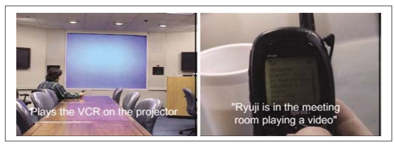
Figure 4. Roomotes is a Web-phone-based universal remote control that notifies friends and colleagues of interactions with the physical world. When a person enters a virtual room or a physical device in the room changes state, the system sends alerts to other people's cell phones. This creates an awareness that brings people together in physical spaces [19].

Call screening concerns establishing communication under appropriate conditions. This class of application uses context to better inform both callers and callees. When initiating conversations in person we usually pay attention to people's situation: who they are with, what they are doing, and where they are. Such context helps to be polite, but also helps to have a productive conversation. For example, it is unlikely you will get an answer to a personal question during a business meeting, or an answer to a business question during a family dinner. The Context-Call and Calls.Calm projects described below share the similar aim of providing callers with context information so that they can make reasonable decisions about initiating conversations.