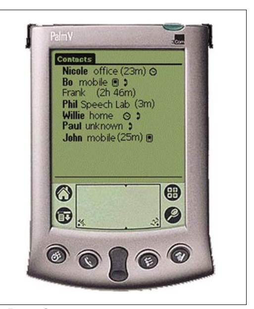
Figure 3. AwareNex shows colleagues and their activities. For example, Nicole is in her office, idle for the last 23 minutes on her workstation, and in the middle of a meeting scheduled in her calendar [17].

Sharing an awareness of one's environment and the context of friends, family, and colleagues can help determine if another person is available for a communication, and can also create serendipitous opportunities for communication. For example, Instant Messenger uses a status (Online, Away, On the Phone, etc.) that gives an indication of a person's availability and willingness to chat. An example of serendipitous interactions occurred in the use of Watchdog [7], an application that allowed people to play an audio clip (e.g., a rooster crowing) when a sensor at the office coffee pot signaled fresh coffee. This contextual reminder had the side-effect of synchro-