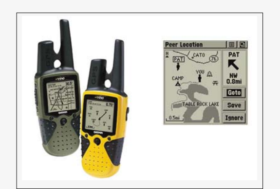
Figure 8. Garmin's Rino GPS Radio gives users the ability to beam their location to other Rino users within a two-mile range and carry on conversations at the same time.