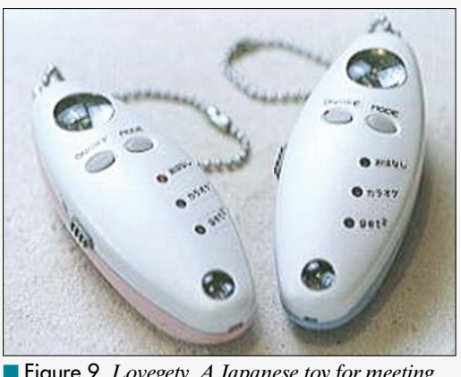
Figure 9. Lovegety. A Japanese toy for meeting people, it beeps when a compatible partner is nearby.

[1] A. Schmidt et al., "Advanced Interaction in Context," Proc. 1st Int'l. Symp. Handheld and Ubiquitous Computing (HUC'99), vol. 1707 of Lecture Notes in Computer Science, Springer-Verlag, pp. 89–101.