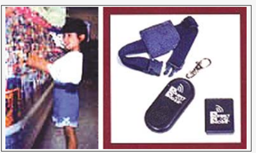
Figure 7. The Parent Pager is a child safety product that activates an alarm when a child wanders more than 15 ft from the adult unit.

Lovegety devices help strangers meet and start conversations by alerting their owners that someone of the opposite sex, also carrying a Lovegety, is nearby (Fig. 9). When a male Lovegety and a female Lovegety device come within 4.5 m (15 ft) of each other, the device's lights flash and a beeper goes off, alerting the owners of a possible rendezvous. Owners set their mode, whether they