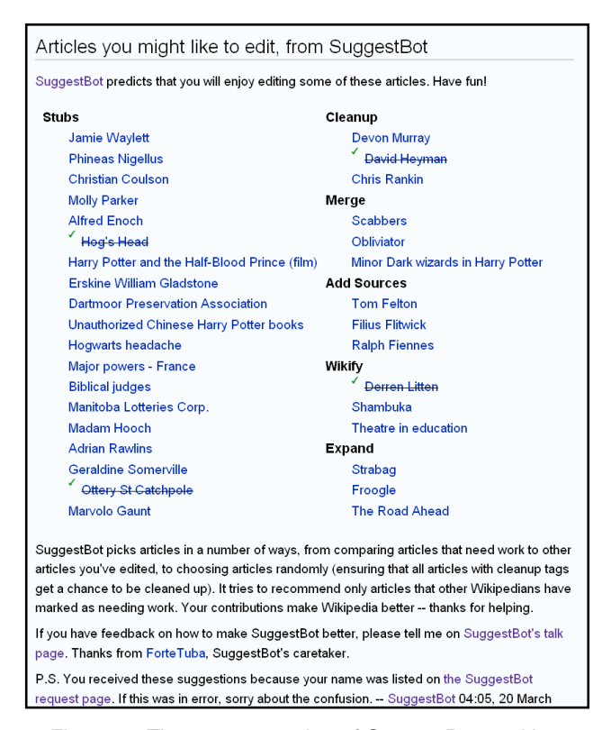
Figure 1: The current version of SuggestBot, making suggestions to Garykirk. The interface explains how and why he got these suggestions, and groups them by the type of work needed. He has edited and checked off several of the suggested items.

We call matching people with appropriate tasks intelligent task routing. In this paper, we describe SuggestBot, a system for intelligent task routing in Wikipedia. We first present theories and prior work that support the use of intelligent task routing as a mechanism for increasing contributions. We next describe how Wikipedia's extensive historical data and active community shaped the design of SuggestBot, followed by a description of how it works. Figure 1 depicts a page of suggestions for a Wikipedia user named Garykirk. To create the suggestions, it used Garykirk's history of edits as input to simple, general recommendation algorithms based on text matching, link following, and collaborative filtering. We close by evaluating SuggestBot. On average, the intelligent algorithms produce suggestions that people edit four times as often as randomly chosen articles. This large difference suggests that intelligent task routing is a powerful tool for encouraging contributions to communities.