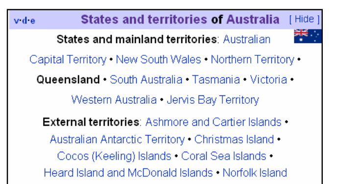
Figure 5: Articles in categories where every page links to every other page in the category sometimes confused the links recommender, causing it to recommend the other pages in the category.

Although the overall performance of the individual recommenders was similar, they failed under different conditions. The text recommender often failed by focusing on one relatively rare word in an article title and returning a series of recommendations containing that word. The links recommender was sometimes tricked by category templates that contain links to the other pages in the category, as in Figure 5. Since every page in such categories points to every other page in the category, these pages would appear many times as the links recommender expanded the profile. The